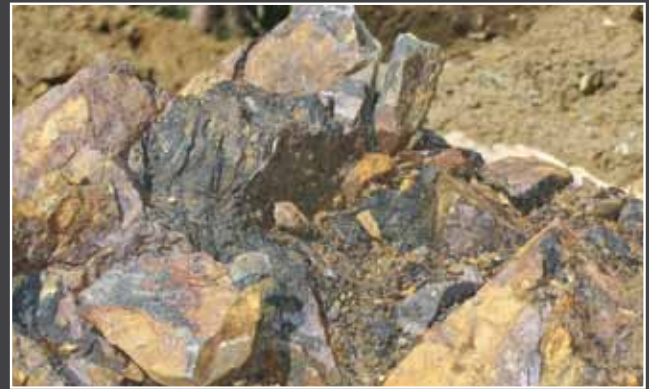
Gossan, Nelligan Property