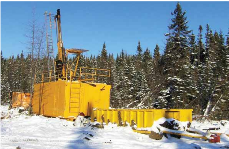
Timmins Porcupine West Gold Property, 13km from Downtown Timmins